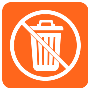
Reduces Landfill Waste