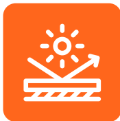
Improves UV Resistance