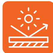
High UV Stability