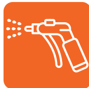
Active Micropore Sealing